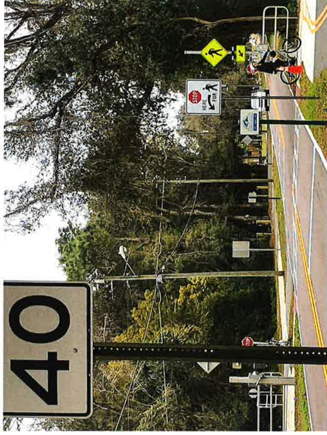
Longwood Markham Road – Trail crossing