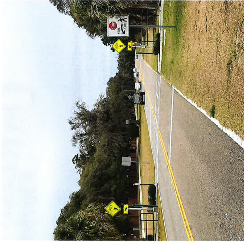
Markham Road – Trailhead crossing