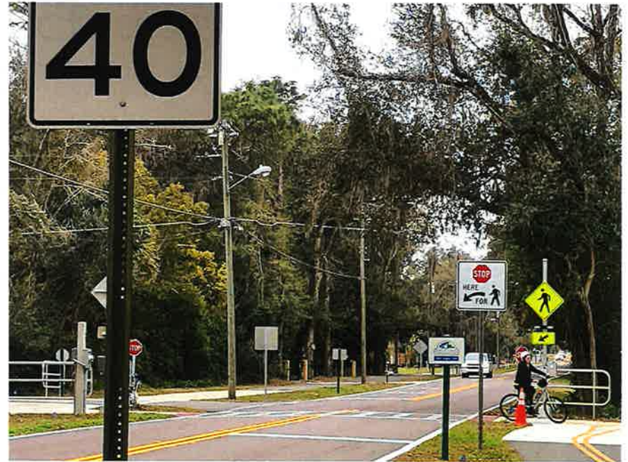
Longwood Markham Road – Trail crossing