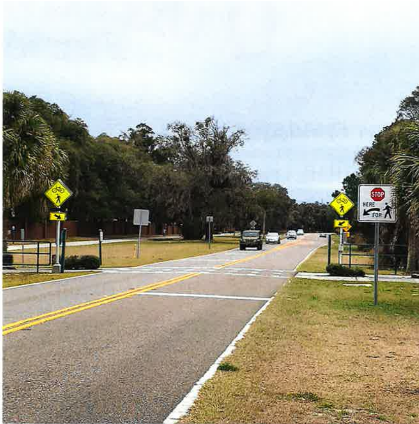
Markham Road – Trailhead crossing