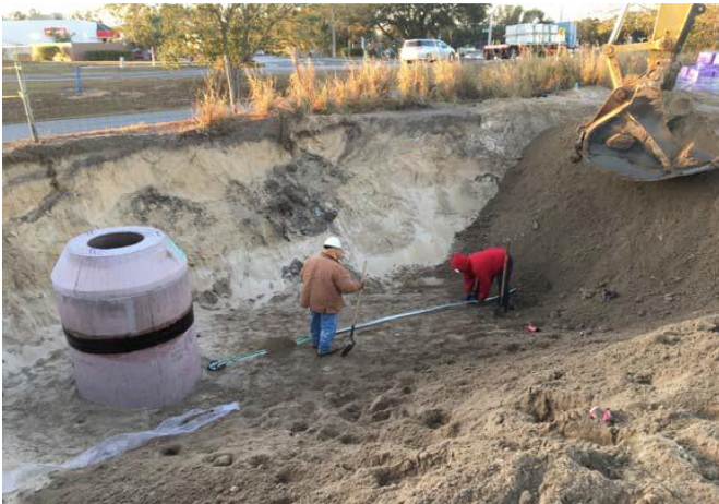
Manhole installation along West Oakland Avenue

A few months ago, the Florida State Legislature appropriated an additional $1,000,000.00 to be utilized in constructing future phases of our sanitary sewer network. This is 100% grant money that we will not have to pay back!! The Florida Department of Environmental Protection, which oversees the administration of the funding, has recently approved our plans to extend centralized sewer to the industrial areas of West Oakland Avenue. They also approved our plans for an extension that is expected to bring sewer availability to the Tubb Street/S.R. 50 area. Once designed and constructed, these improvements are expected to spur economic growth in those areas of the Town.