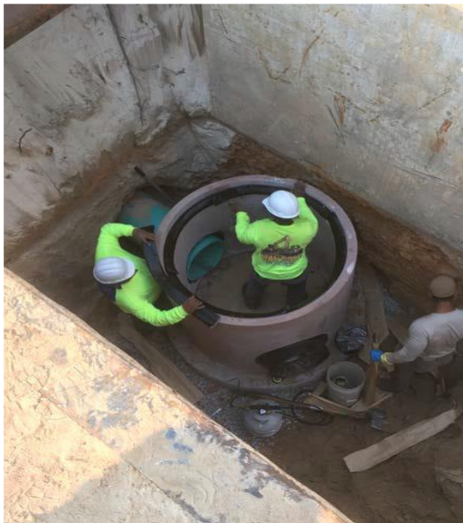
Sanitary sewer construction near the Circle K convenience store