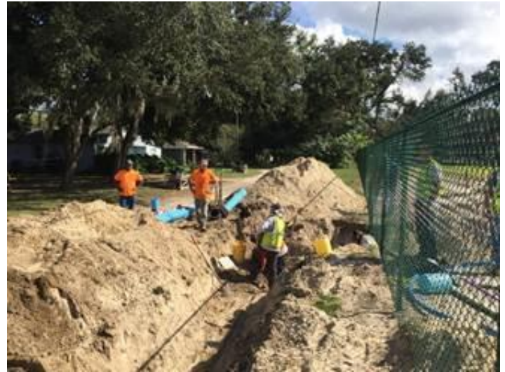
Water Main Construction

Over the course of the next several months, construction activity will be taking place along the streets mentioned, as well as Machete Trail and Oakland Avenue. All construction at this time is upon Town-owned properties, or within rights-of-way and easements, and will not impact residential properties.