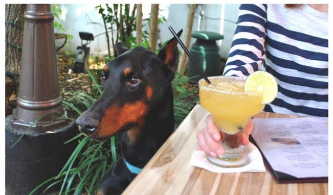
Doggie Dining Ordinance passed.

In cooperation with the West Orange County Chamber of Commerce, the Town of Oakland has adopted a unified approach to doggie dining. This policy is embodied in an ordinance that will prepare the Town of Oakland for friendly but well-thought out provisions for dining with the pet dog. While the Town of Oakland does not actually have any restaurants at this date, we are eagerly anticipating our first sit-down restaurant establishment. We've recently updated our zoning code to permit restaurants to serve beer and wine by right in C-1, Commercial Zoning. With the "Dog-Friendly Restaurants" ordinance, the Town will be ready to compete in this highly competitive market. The ordinance passed the Planning and Zoning Board unanimously on February 19, 2019, and the Town Commission passed it at the March 26, 2019 reading.