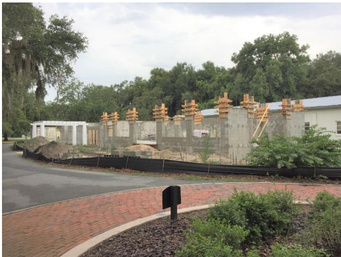
Arts and Heritage Center under construction.

As an added feature, a walkway is being planned which will connect the Center with Speer Park. Situated along Cross Street, it will be eight feet wide and meander among the huge oak trees that line the street. This improvement is scheduled to be ready just in time for the Oakland Heritage and Wildlife Festival to be held on October 26.